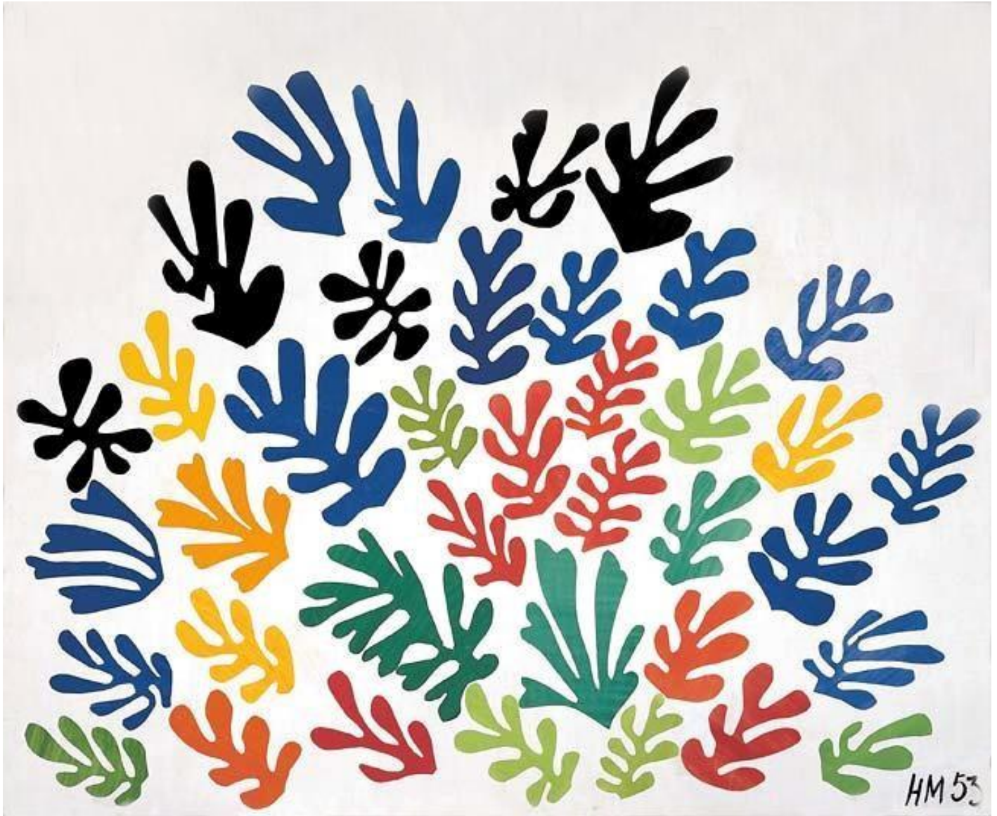
Leonardo da Vinci: Lady with an Ermine