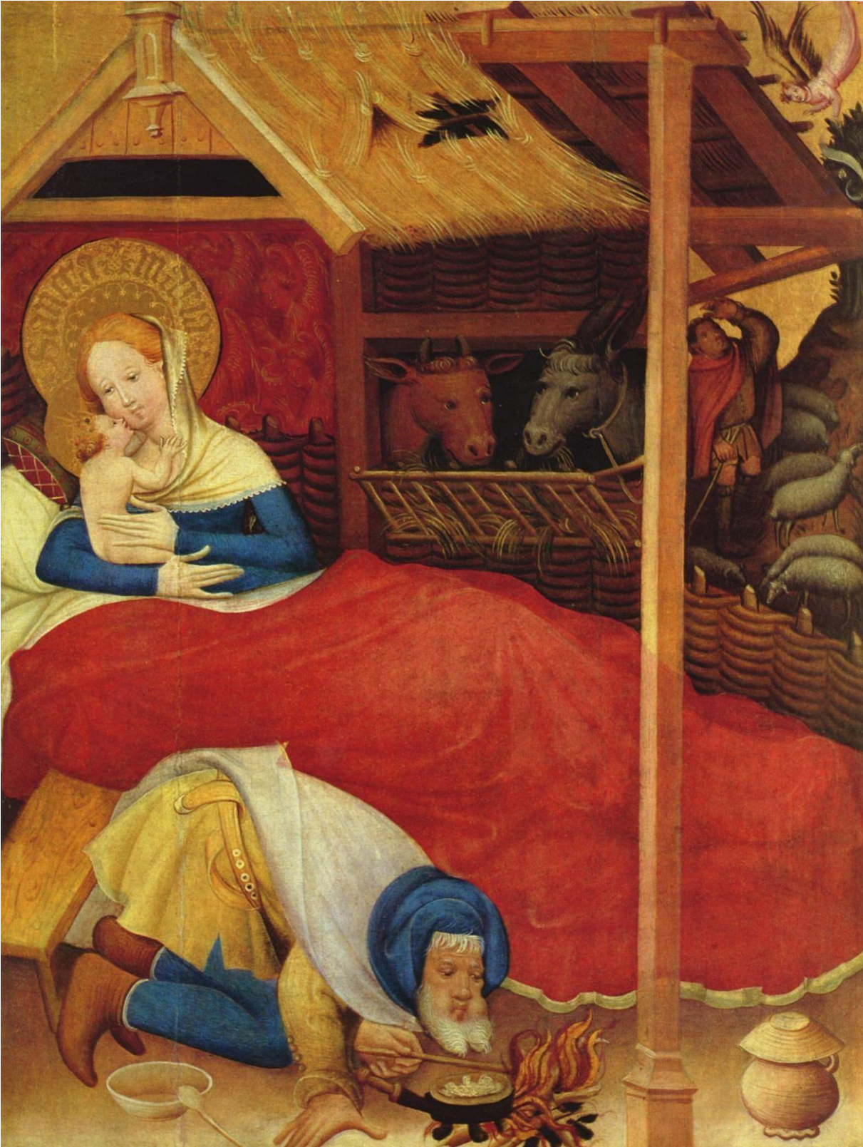
Conrad von Soest: The Nativity